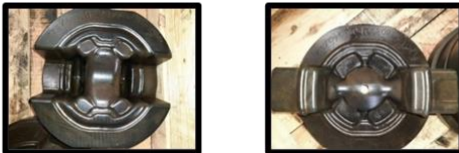
Figure 3. Coated Die situations before the forging process

FEXOY® coating obtains wear resistance, excellent lubricated and it uses at hot forging dies and metal injection operations. Thickness range of the FEXOY® is 12-15 µm.