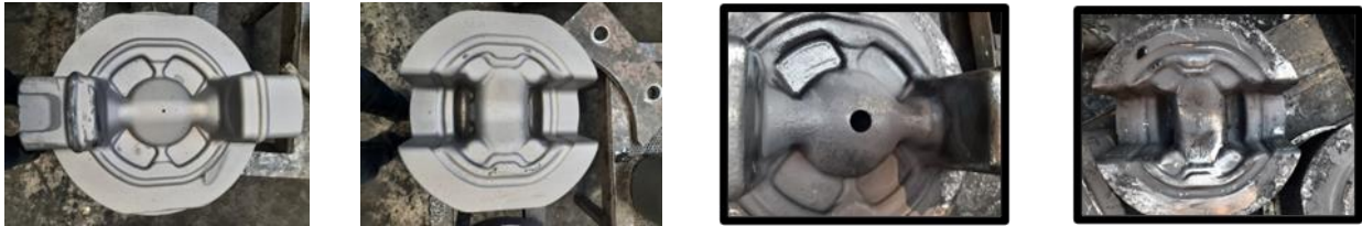
Figure 5. Coated Die situations before the forging process and Coated Die situations after the forging process

ABP+Dietox® coating is a shot peening process that introduces compressive stress to the surface of material. It is a simple method for increasing fatigue and wear resistance of tooling materials. Coating material have similar properties with FEXOY® which applied to Unimax® die steel.