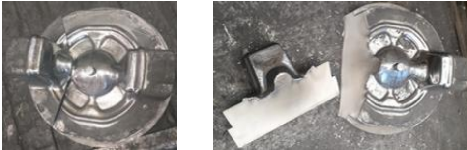
Figure 2. Coated Die situations after the forging process

As tool steel, DIN1.2344A is used. After the forging process with 425 cycles, a fracture occurred in the radius region of the uncoated die. It has been observed that abrasions occur on the die surfaces along with breakage.