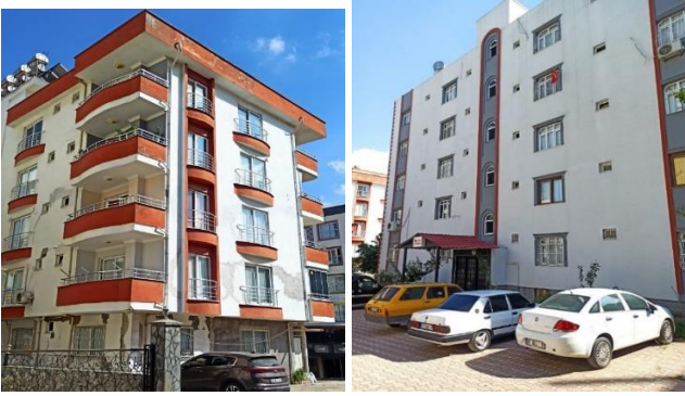
Figure 1. Buildings with and without Canopy (Archive).

in Fakuşağı District of Osmaniye, on island 248, parcel 6 (building on the left) and island 247, parcel 9 (building on the right), the building with a closed exit was damaged, while the building without a closed exit survived the earthquake without any damage. Of course, it would be incomplete information to say that the damaged buildings were damaged only due to closures. In addition, soft storey irregularity, short column effect, ground liquefaction, inadequacy of ground improvement works, lack of engineering services and workmanship in structures, material quality, technological impossibilities, inadequacy of regulation and inspection mechanism, etc., which are generally examined under the disciplines of civil and geotechnical engineering. Many different factors can be considered.