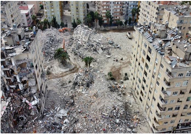
Figure 2: Image of Osmaniye Province 6 February Earthquakes (URL_3).

Figure 2 shows the earthquake-affected view of the site, which consists of 14 blocks and 9 floors, all with closed exits, located on island 2955, parcel 1, in Adnan Menderes District, Adnan Menderes District, Osmaniye Province. In case of a closed exit along with many different factors mentioned above, it is necessary to consider the earthquake effect as a whole. Therefore, if the buildings had been designed and built with a frame system that met the load-bearing system requirements from the ground up, rather than with a closed cantilever, they would have been less affected. Of course, for this purpose, a detailed scan should be made and the existing building data should be processed into the computer environment, earthquake performance analysis should be carried out in the same structure without a closed exit and the results should be compared. Only in this way can