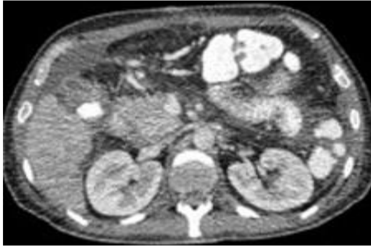
Figure 2. Biopsy of the bowel and splenectomy results revealed infection and bone marrow biopsy diagnosis was Myelodysplastic syndrome. The abdominal pathologic findings were disappeared at the third month follow up diagnostic CT.